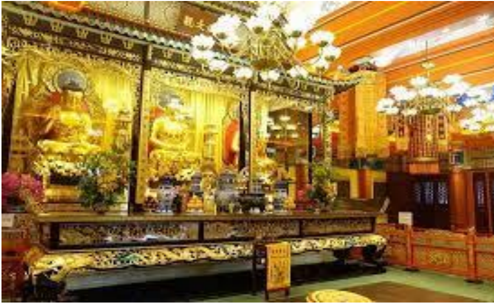
Po Lin Monastery

This journey will take us to some of the oldest and most revered Buddhist sites in China, including early Chan (Zen) monasteries. Over sixteen days, we will travel from Beijing to the Dunhuang Caves in the desert of Gansu province in the far north, where Buddhism first reached China from India along the Silk Road. We will explore Kumbum, one of the largest Tibetan monasteries in north-west China; the ancient Imperial capital of Xian; the renowned shrines and statues of the Longmen Grottoes; and the sacred mountain of Wutaishan, covered with temples and hermitages that date back hundreds of years and are still active today.