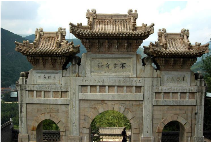
Wutai Temple, Wutaishan